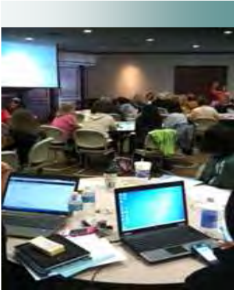
Magale librarians hosted school media specialists for an all-day in-service.