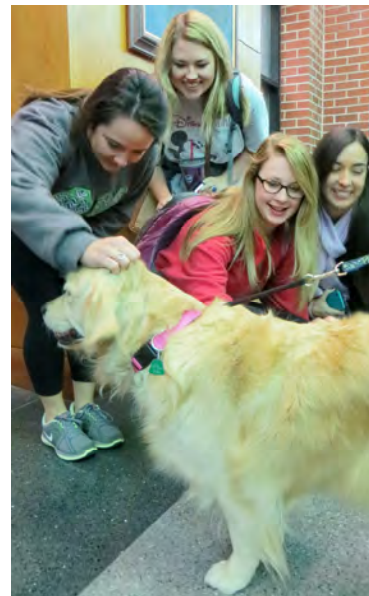
Therapy dogs visit Dupré Library during finals.

Certified therapy dogs and their handlers visited the Library during finals to help students de-stress. Promoted as a "fun and furry event," the dogs' visit drew a large crowd of students into the Library and created much positive publicity. The new Dupré Library Outreach and Events Committee planned this event. Take a look: http://www.youtube.com/watch?v=hJfRWoMM354 .